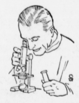
is protected from the FARM TO YOU

Cleanliness is paramount in the production and delivery of Morningdew Milk. But cleanliness alone is not enough. Scientific inspection protects the purity of Morn-