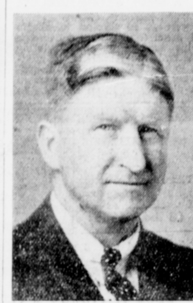
resident, seeks republican nom