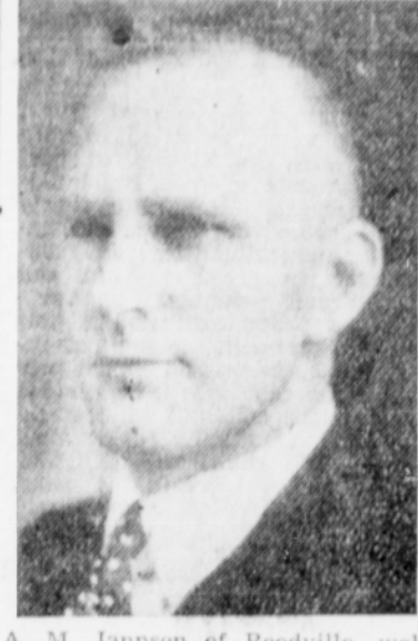
serve this county as a representa-