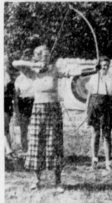
Turn about's fair play so some redskin is going to bite the dust when this fair archer lets go!

vicinity in the past, has been rather high, employment officials point out.