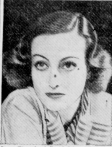
Joan Crawford in "I Live My Life" Sunday, Monday and Tuesday feature at the Venetian. Brian Aherne plays opposite her.

Friday afternoon with their parents as guests. Recitations and songs were given. Refreshments were served the children and the parents.