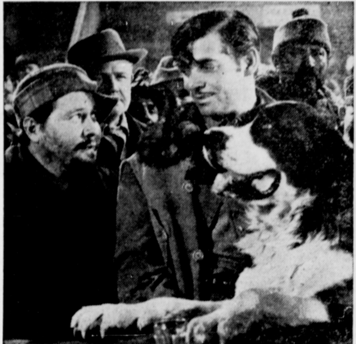
Jack Oakie, Clark Gable and "Buck," new canine film find, who are the leading characters in the film version of Jack London's "Call of the Wild." The film will be shown at the Venetian Sunday, Monday, Tuesday and Wednesday.