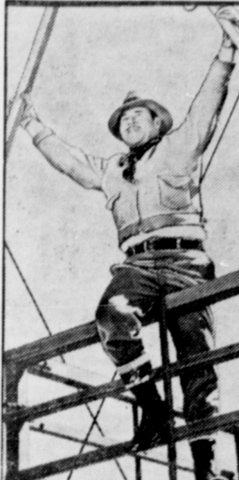
Jack Holt in "Awakening of Jim Burke," at the Venetian theatre tonight, Friday and Saturday.