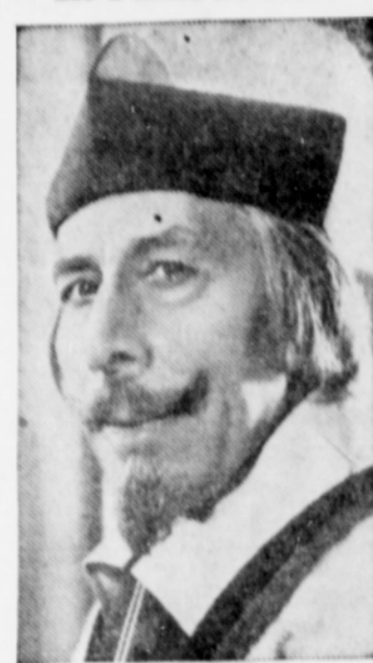
George Arliss who will be starred in "Cardinal Richelieu" at the Venetian Sunday, Monday and Tuesday.

"What Did Aimee Find in Palestine?" Sermon topic, "The Roaring Lion Still Walks" (I St. Peter 5:3). Immediately after chapel a meeting of the Society of Pilgrims will be held, to transact necessary business July 11. At 8 p. m., general meeting of fathers of members of Christian Council clubs.