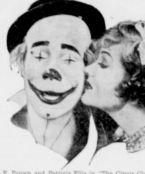
Joe E. Brown and Patricia Ellis in "The Circus Clown," coming to the Venetian theatre Friday and Saturday.