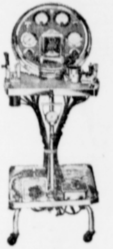
Sun Motor Testing Machine

We have met all competition in the past. Observe the character of our patrons in this community, and ask them.