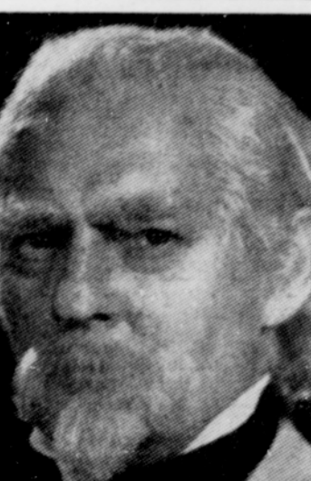
Shirley Temple, America's screen darling, who will appear at the Venetian theatre tonight, Friday and Saturday in "The Little Colonel." Lower: Lionel Barrymore, who is co-starred with Shirley Temple.