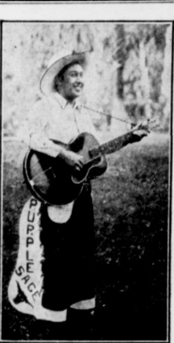
Two members of the "Purple Sage Riders" who will appear on the Venetian stage Sunday and Monday. Film feature will be "Grand Old Girl," starring May Robson.