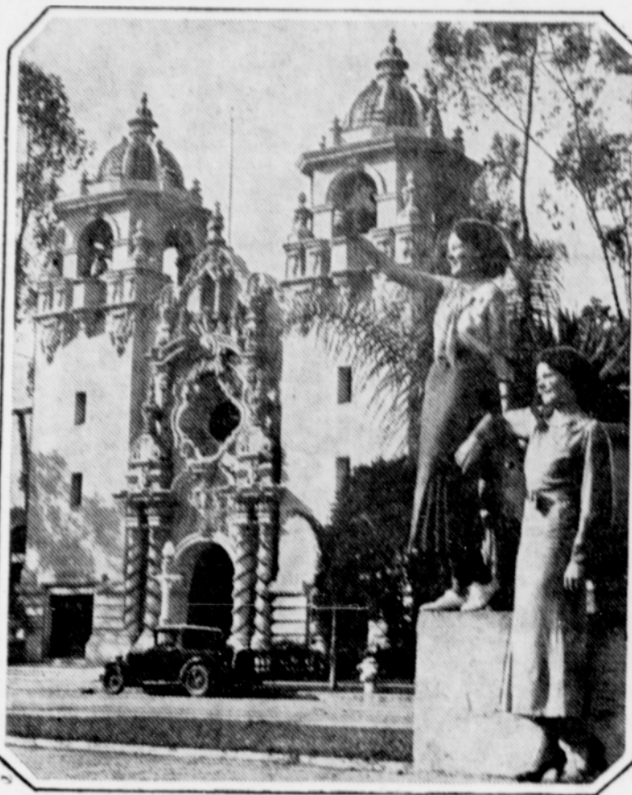
Two of San Diego's "fair" representatives greet visitors to the cathedral-like Palace of Foods and Beverages, one of the exotic buildings which will house exhibits at the California Pacific International Exposition.

Elsewhere in the exposition grounds, the progress of science, history and transportation will be vividly enacted, step by step.