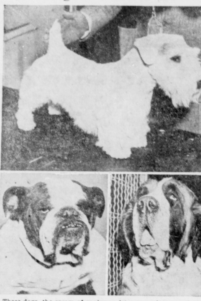
These dogs, the cream of canine society, seemed to run the gamut of emotions as judges named their winners in their classes at the recent New York dog show. As the Sealyham Gunst de Babs of Hollybourne, above, proudly displayed his sleek dapperness, surly, disgruntled Drinkmoor Moonshine, the English bulldog shown bottom left, seemed to snarl "sissy." And by that wary, resigned expression on the face of Herculeus Indisputable, the rough-haired St. Bernard, you just know he's wondering what dog shows are coming to.