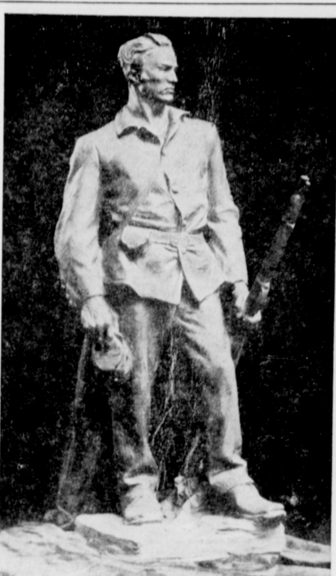
Picture above is taken from sketch of proposed memorial to men of Civil War ranks to be erected at statehouse grounds, Salem, by the Sons and Daughters of Veterans of the Civil War, Oregon association...