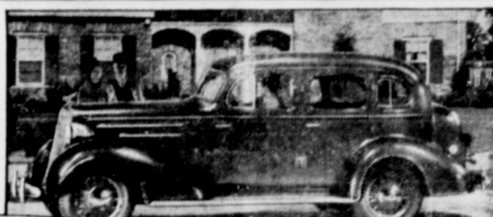
Fast, graceful lines also mark the new Master De Luxe Sport Sedan. Ample luggage space is provided by the built-in trunk, and a luggage compartment behind the rear seat cushion.