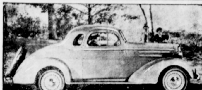
The Coupe model typifies the beauty and style of Chevrolet's new Master De Luxe series for 1935. Improved performance and exceptional economy also characterize these cars.