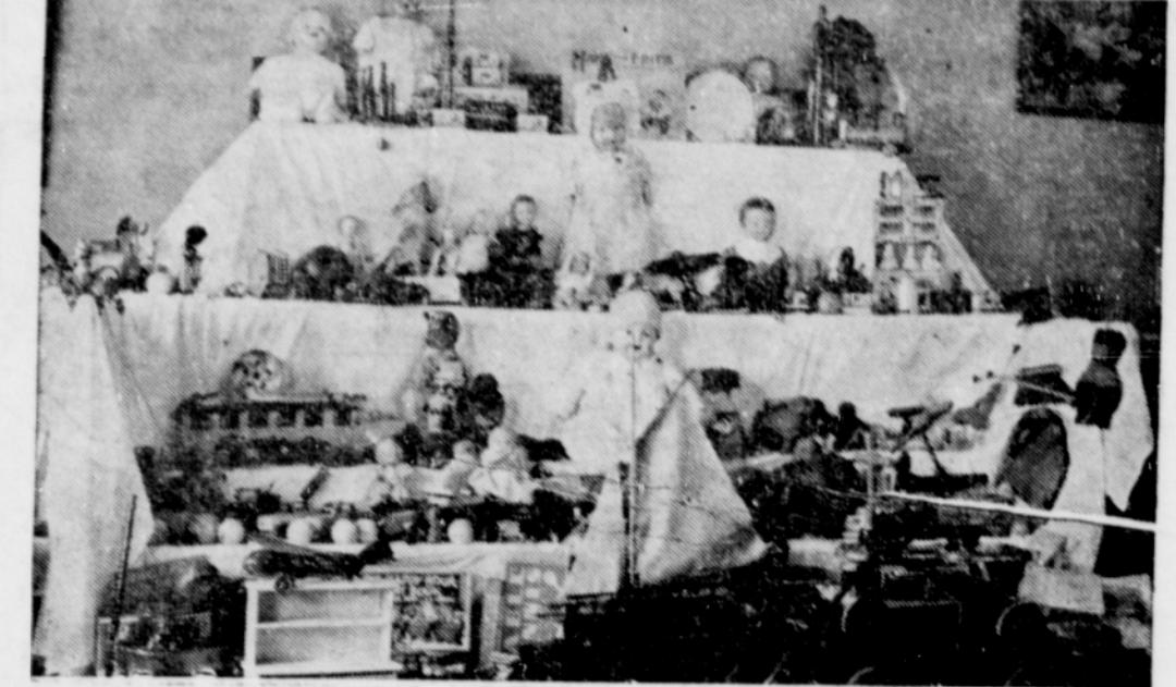
Toys given to underprivileged children of Hillsboro by the Coffee club at a Christmas party Sat-urday afternoon at chamber of commerce.