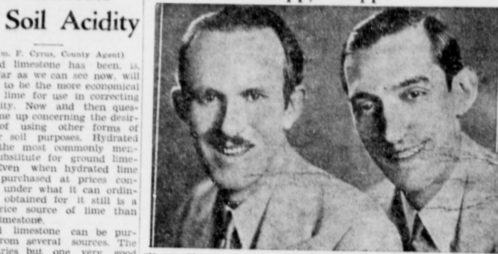
price varies but one very good world famous song writers, are coming to the Venequality ground limestone that is better than some of that we have Seattle and Portland. They are radio stars of NBC, CBS, and KNX, been getting can be delivered on the farm in Washington county in now oroadcasting over KEX and KOIN.