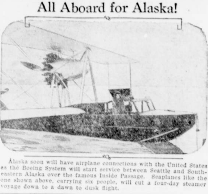
Alaska soon will have airplane connections with the United States as the Boeing System will start service between Seattle and South-eastern Alaska over the famous Inside Passage.

Alaska soon will have airplane connections with the United States as the Boeing System will start service between Seattle and South-eastern Alaska over the famous Inside Passage. Seaplanes like the one shown above, carrying six people, will cut a four-day steamer voyage down to a dawn to dusk flight.