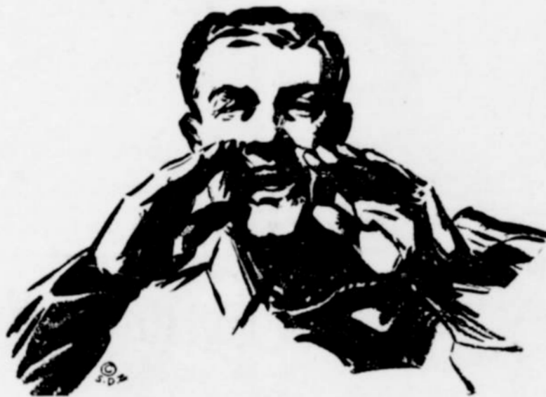
Be sure to come to opening of Willamette Valley's finest laundry and dry cleaning plant.

through the Laundry-Owners' National Association, which maintains an extensive experimental station at Mellon Institute, in Pittsburgh. We have adopted the new easier-on-clothes methods of modern science.