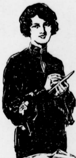
We have put an END to washdays in hundreds of local homes.

The Home Laundry of Hillsboro has subscribed to this scientific effort—contributed to its support,