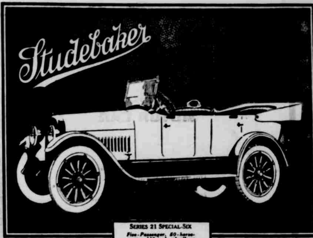
SERIES 21 SPECIAL-SIX Five-Passenger, 60-horsepower, 119-inch wheelbase $1750 f. o. b. Detroit

For Sale—500 White Leghorn pullets, nearly 3 months old, of famous Potalum heavy laying strains. These pullets have been roosting without heat several weeks.—Chas. Fager, Hillsboro, R. 4; Virginia Place; 1 1/2 miles East of Hillsboro. 7-8