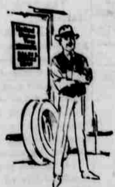
"The most essential man for you to know today in the tire business is your local U. S. Tire Dealer."

Its very simplicity—two diagonal rows of oblong studs, interlocking in their grip on the road—the result of all the years of U. S. Rubber experience with every type of road the world over.