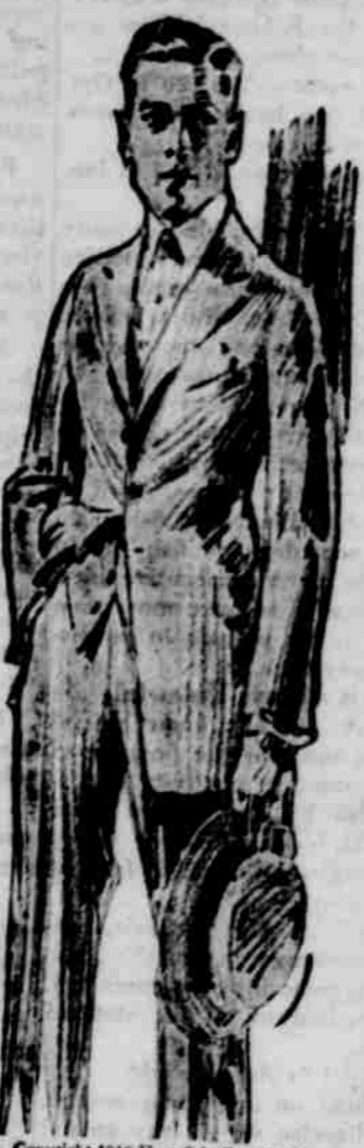
Copyright 1919 Hart Schaffner & Marx

SPEAKING OF LOW PRICES WE OFFER--MEN'S ALL WOOL SUITS--Tailored in the latest and most desirable styles--sizes 33 to 44 at sensational, knock'em dead price of $19.85