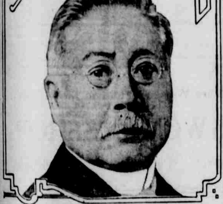
Ng Poon Chew, who is to lecture on the third night at Chautauqua, is perhaps the best known man of his race in America. He founded the first Chinese daily paper in this country and is an authority today on all matters pertaining to China.

Ng. Poon Chew the Noted Chinese Journalist and Statesman Possesses Great Fund of Humor