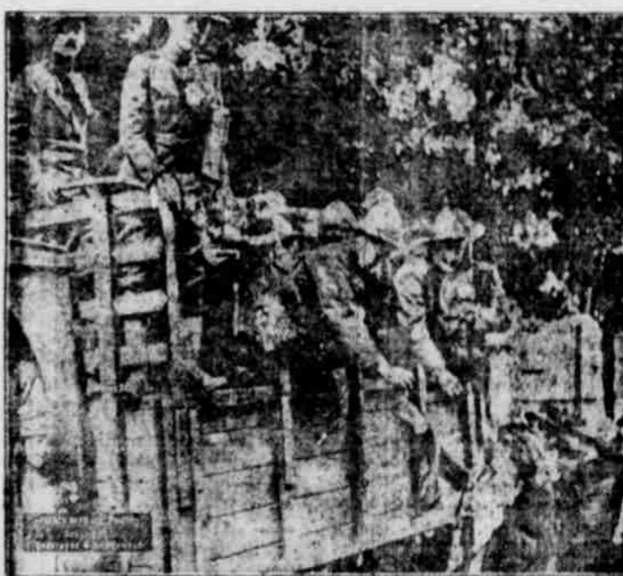
MOTORS SPEED THEM TO FRONT

Motor trucks by the tens of thousands have made the Great War different from any other in adding mobility to the opposing armies. Where preparation for battles in previous years required days, hours are now necessary. Since tankcabs won the first battle of the Marne, gasoline and rubber have been increasing factors.