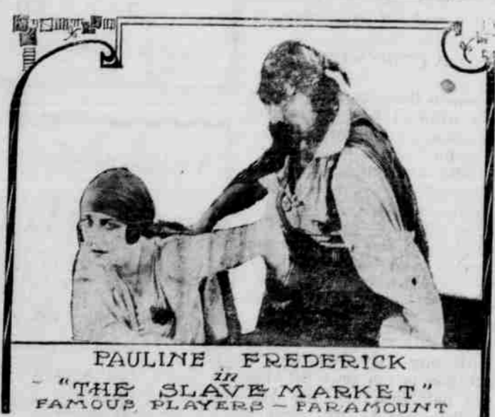
PAULINE FREDERICK in "THE SLAVE MARKET" FAMOUS PLAYERS - PARAMOUNT