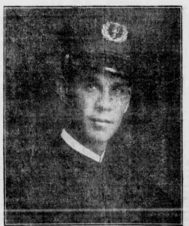
Who will conduct the repertoire of ninety bandsmen in Hillsboro's Fourth of July celebration, and also at the Sunday concert