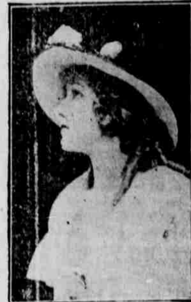
GRACE DARMOND, Patho Star of the "Shielding Shadow"

Don't miss the first chapter. This serial cost us twice as much as any ever run in Hillsboro.