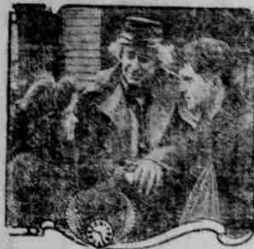
Scene From the Thanhouser-Mutual Three-part Drama, "The Spirit of '61."