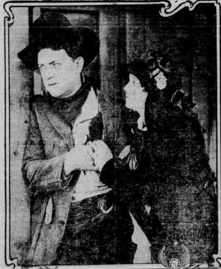
SCENE FROM "THE STAIN IN THE BLOOD," MUTUAL MASTERPICTURE, DE LUXE EDITION, IN FIVE ACTS, PRODUCED BY SIGNAL.