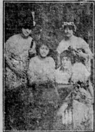
MAURER SISTERS ORCHESTRA.

For versatility on musical instruments the parallel of the Maurer Sisters is seldom found. In this respect they fill an important place in the Lyceum, for there is much demand for just such a combination. The daily reason that there are comparatively