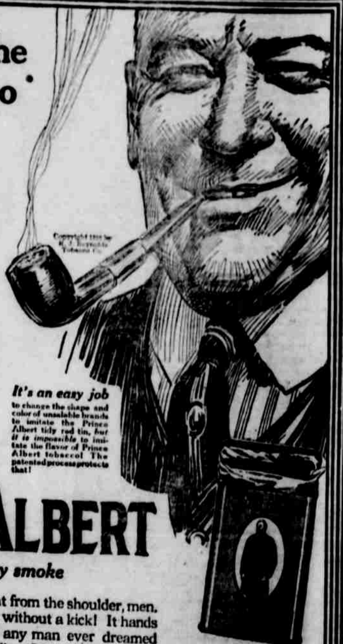
It's an easy job to change the shape and color of unstable brands to imitate the Prince Albert tily red tin, but it is impossible to imitate the flavor of Prince Albert tobacco. The patented process protects that!

when you fire-up some Prince Albert in your old jimmy pipe or in a makin's cigarette. And you know it! Can't get in wrong with P. A. for it is made right ; made to spread-smoke-sunshine among men who have suffered with scorched tongues and parched throats! The patented process fixes that—and cuts out bite and parch. All day long you'll sing how glad you are you're pals with