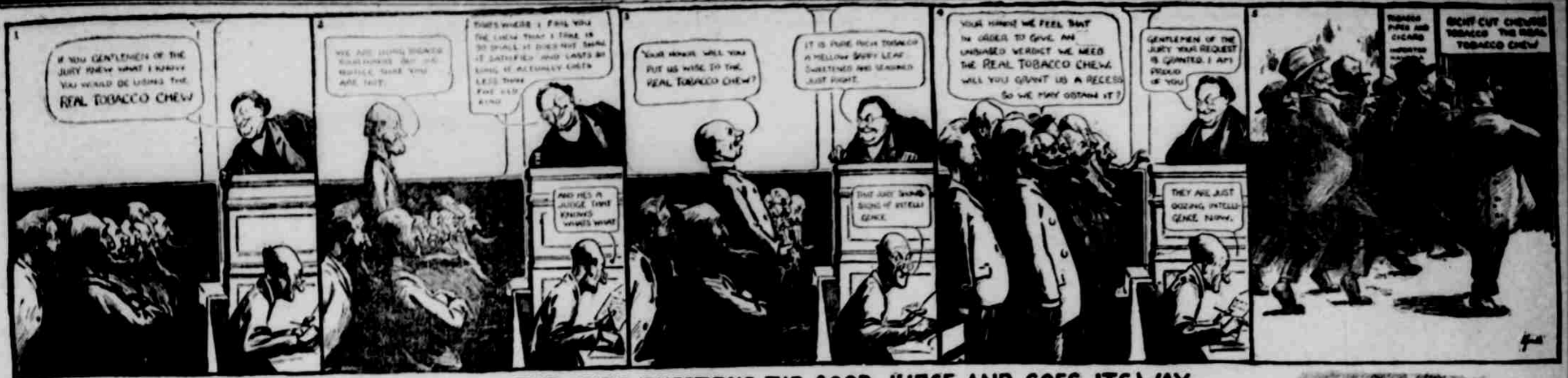
THE JURY QUESTIONS THE GOOD JUDGE AND GOES ITS WAY