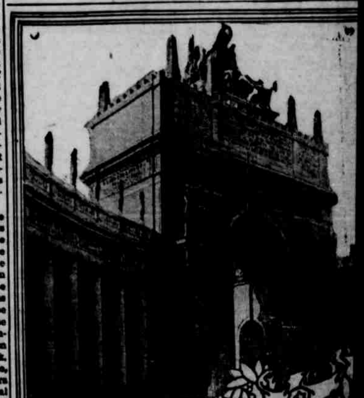
Vast Triumphal Arch at the World's Greatest Exposition, the Panama-Pacific International Exposition, San Francisco, 1915.

Imagine, for the purposes of illustration, the interest, action and poverty of ten great circuses like Barnum & Bailey's combined into a single "greatest show on earth" and presented at ten times the cost of the single production and an idea is gained of the originality of this section. A total of more than eleven millions of dollars has been expended in its establishment. The concessions, as these less serious features of the Exposition are known, include a great open air panoramic reproduction of the Yellowstone National park and a similar representation of the Grand Canyon of Arizona, presented by two of the transcon-