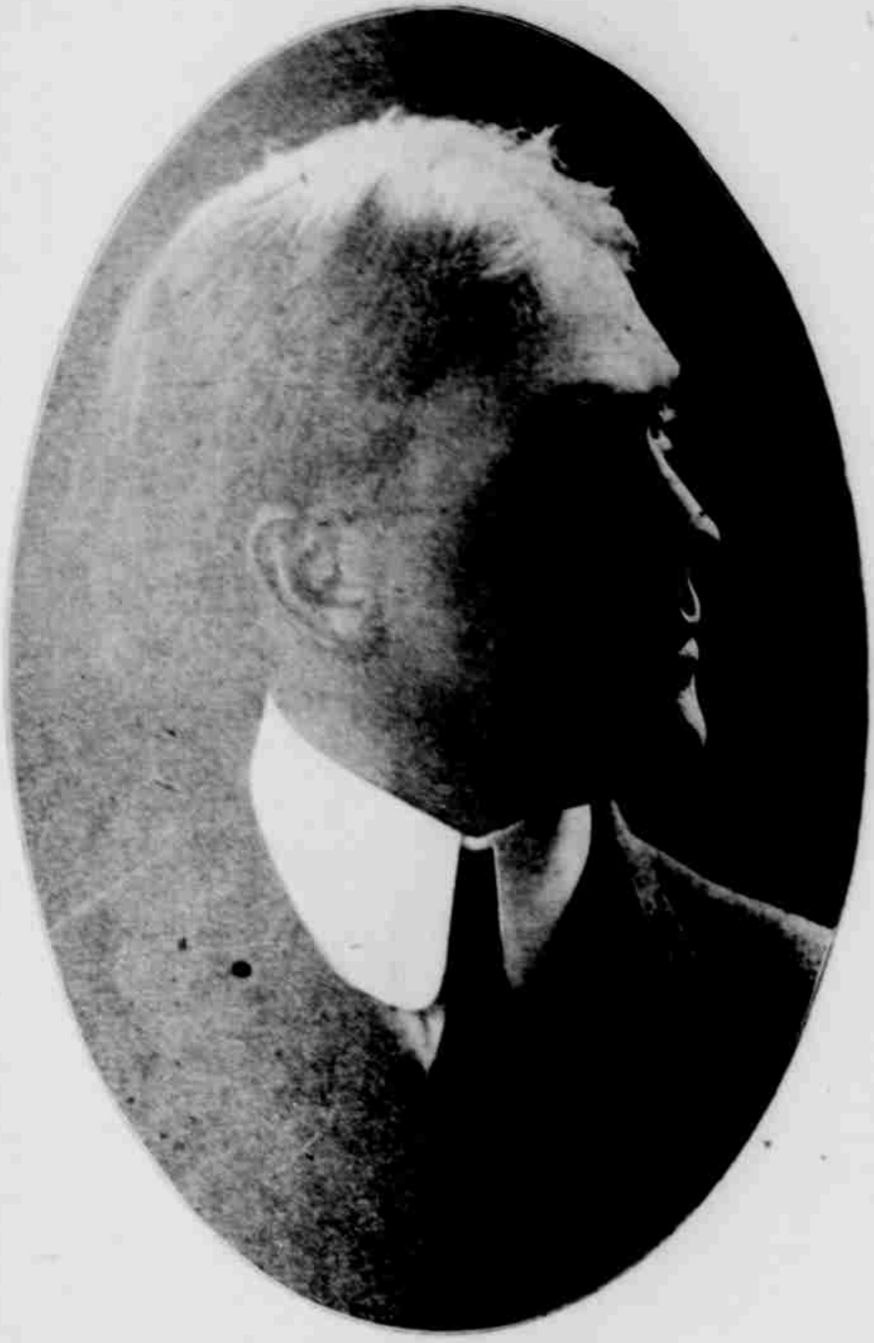
C. L. McNARY

Never held a Political Office, is at present a Judge of the Supreme Court, he has been tried and has made an En enviable Record on the Bench. A self made man, a credit to the legal profession. No mistake can be made by Re-nominating and Re electing him. He is honest, capable and fearless. See page 20 voters pamphlet.