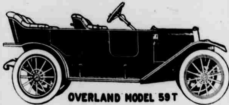
OVERLAND MODEL 59T

The Biggest Value on the Market. For demonstration see, telephone or write