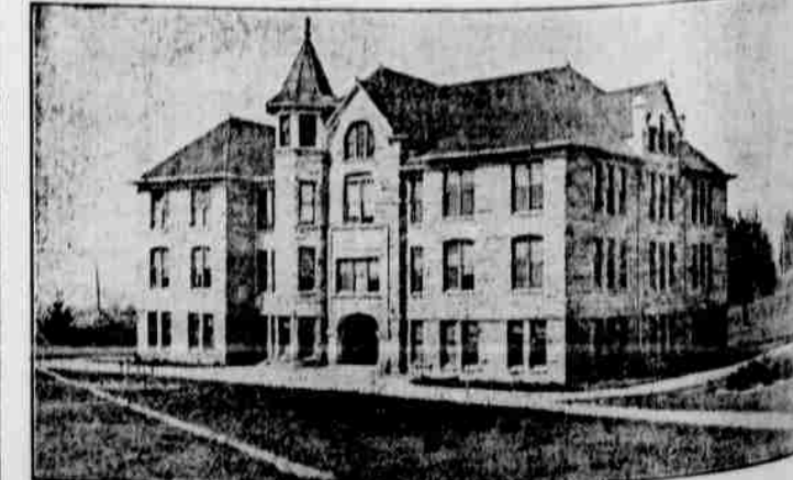
THE CHEMISTRY BUILDING AT THE O. A. C.