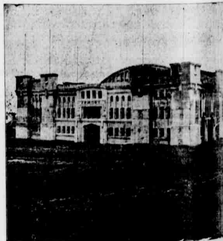
THE NEW O. A. C. ARMORY.

Familiar Buildings to Many Washington County Students