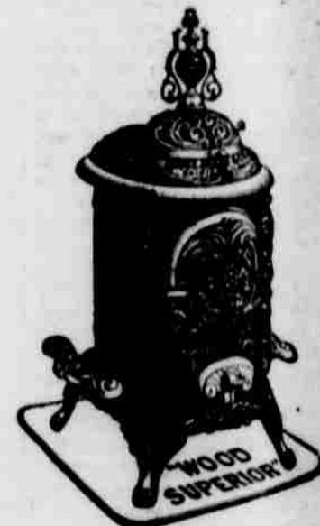
The Wood Superior Neat and Nobby.

Our heaters can not be excelled for durability and finish. They will grace any parlor. We have stoves for $1.25 up to $15.00. We deliver and set up free of extra charge.