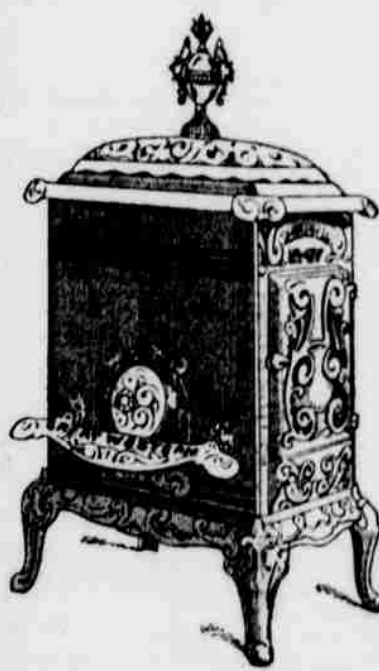
The Great Western A Beauty

Now is the Time for Heaters Ours is the PLACE to Get Them.