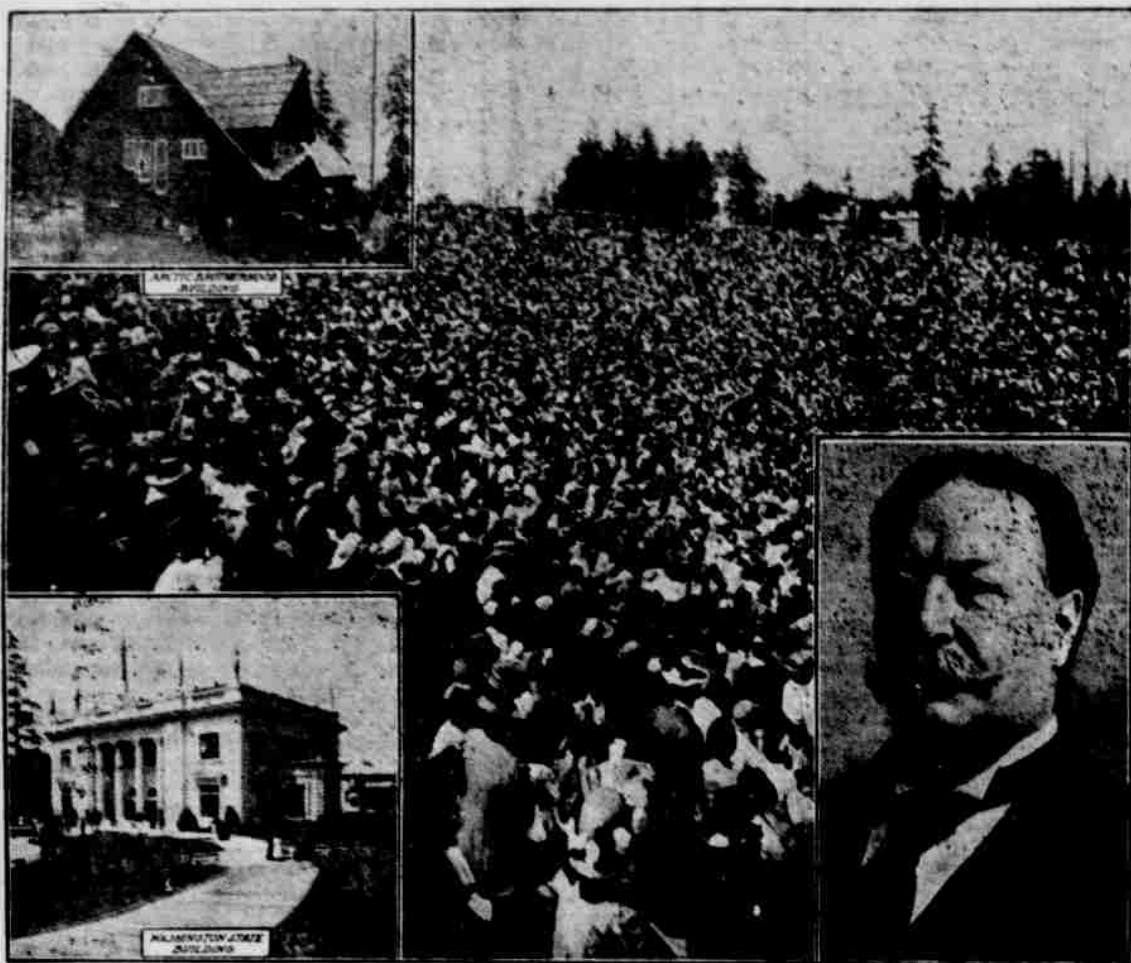
THE PRESIDENT WILL ADDRESS A MONSTER CROWD IN THE NATURAL AMPHITHEATRE DURING HIS VISIT TO THE EXPOSITION.

PRESIDENT WILLIAM HOWARD TAFT is to be the principal actor in a varied interesting program, which awaits him upon his arrival at the Alaska-Yukon-Pacific Exposition in Seattle from September 29 to October 1. From the moment Bill Taft sets foot on the paved walks of the exposition he will have to hurry to keep pace with the various events in which he is scheduled to take part. His activities will have a wide range, too. And, then, the president's good nature is proverbial and his lieutenants have sent on word that the president will do his part to make the day a big success. His most formal appearance on the exposition grounds will be at a reception in the Washington state building at the official banquet. Following in line will be his initiation into the Arctic Brotherhood, the Alaska fraternal association. The president will also find time to address a monster crowd in the Natural Amphitheatre, mush down the Pay Streak, attend an elaborate luncheon, visit the United States government buildings and the Igorrote village. September 30 at the Alaska-Yukon-Pacific Exposition will be one of the president's busiest days in the west and the people will be given every opportunity to see and hear him during his visit to the fair.