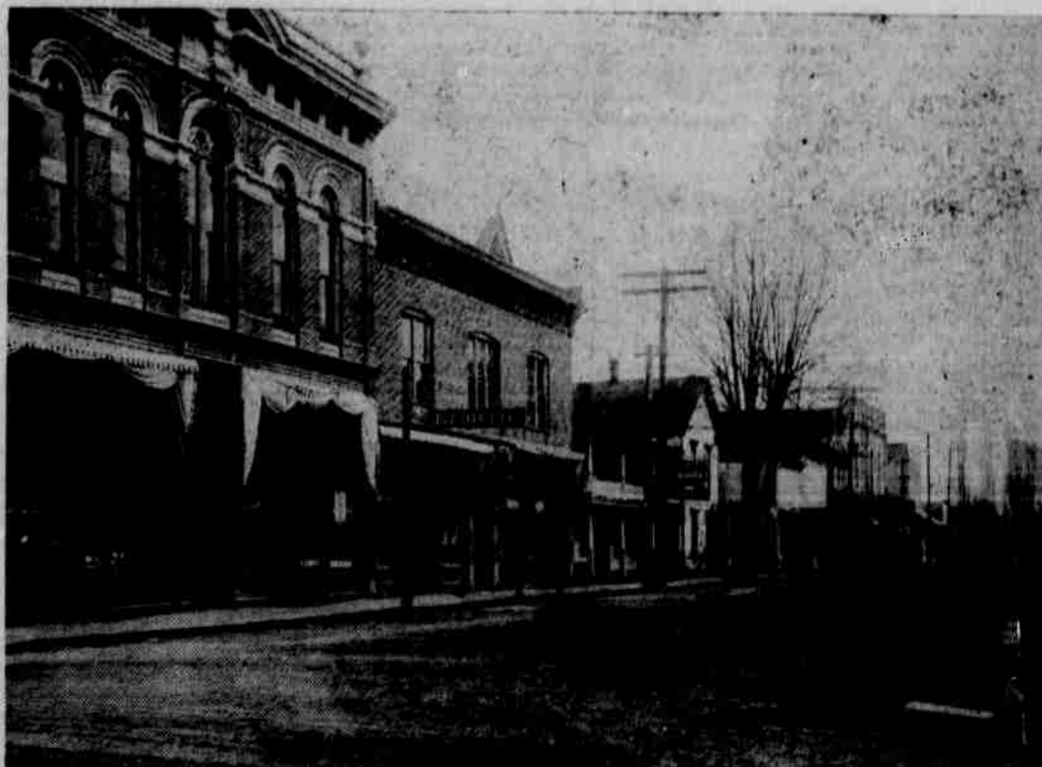
Street Scene in Hillsboro

Millions of copies containing information County are to be circulated among the prosperous farmers of the Middle West, and this will without doubt result in bringing hundreds of new settlers to this section within the next few months.