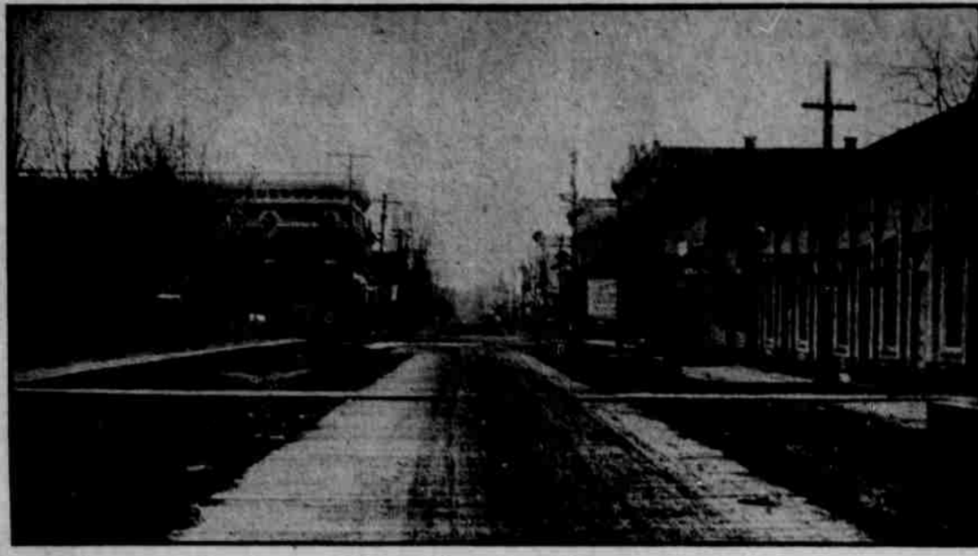
Street Scene in Hillsboro Some Hillsboro Items

The arrangement of the top floor will follow the same general outlines as the second, with the exception that in place of the parlor, a commodious reception room for public meetings will be provided.