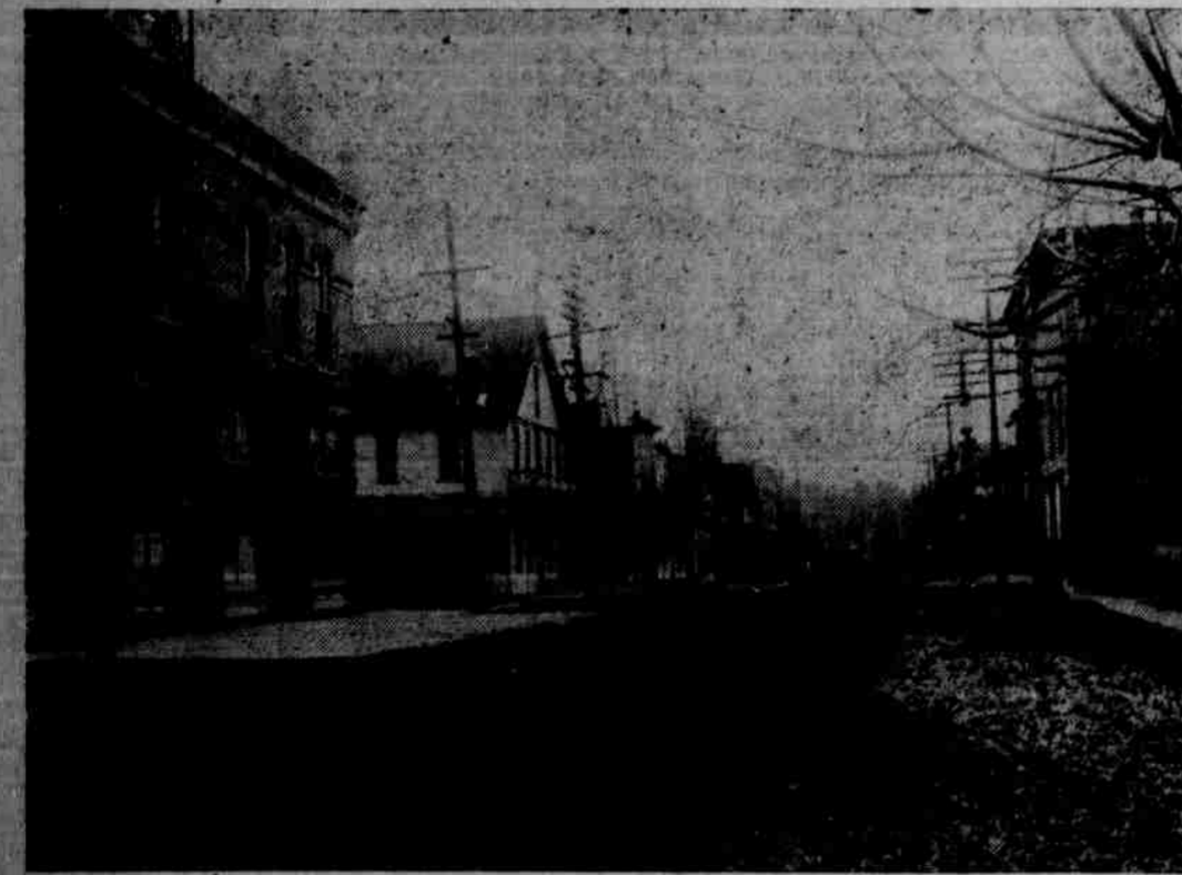
Street Scene in Hillsboro

The extensive advertising proposed, in order to secure more residents for the country districts will find ready attention, and as the farms are reduced to smaller dimensions and the tributary territory thereby containing much greater population in same area, all business, mercantile or otherwise, will further increase the wealth and prosperity of the community.