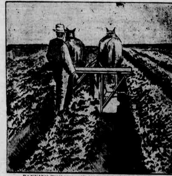
BANKING THE CELERY WITH A DOUBLE PLOW

Be sure your sins will find you out if you are ever a candidate for office.