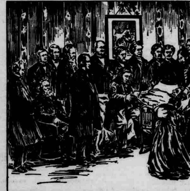
THE DEATH BED OF PRESIDENT LINCOLN.