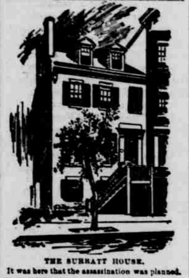
THE SURRATT HOUSE.