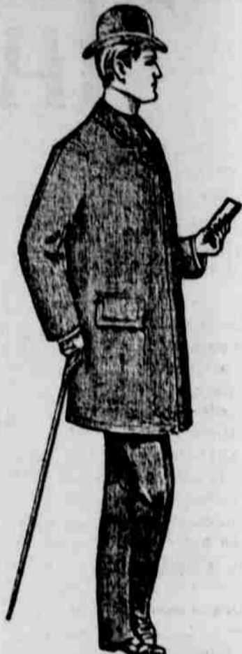
THE LABEL OF THE FAMOUS

Men are not influenced by blow, brag or bluster, if they were, we too, could outpound the advertisement boiler factory as some do. But in a quiet sort of way try to impress upon you the fact that we are Clothing leaders.