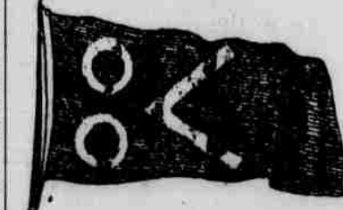
FLAG OF PHILIPPINE INSURGENTS.

If the report of General Augustin be true, and its accuracy is not questioned here, the probabilities are that official dispatches will be received by the government in a day or two at the latest. The flight of General Augustin from Manila created some amusing comment tonight. As one official expressed it,