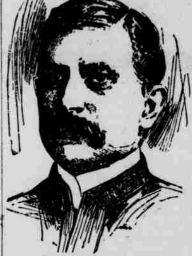
BRIG. GENERAL FRANCIS V. GREENE.