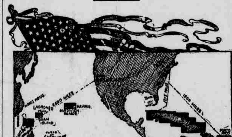
The above map shows the territory that has been, or will undoubtedly be, added to the United States as a result of the war with Spain—Cuba, Porto Rico, the island of Guam, or Guaban, in the Ladrones, and a coaling station and port in the Philippines.

people would be more interested than they are in maintaining property and all other rights.