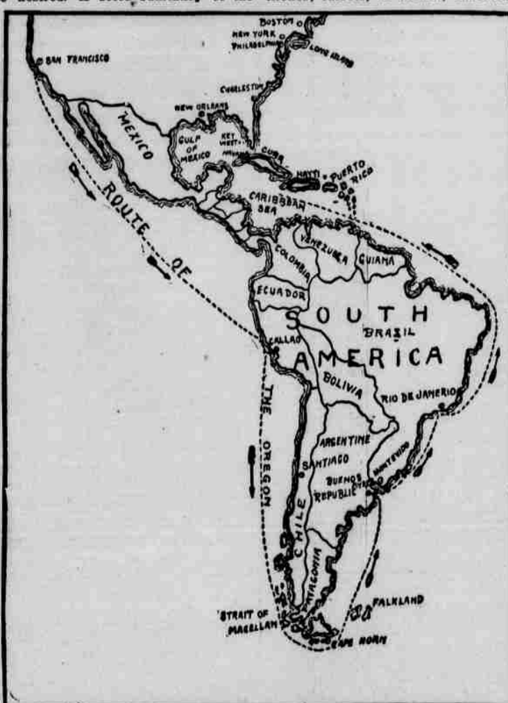
MAP SHOWING OREGON'S LONG TRIP.

In size the Oregon is only surpassed by one ship in the navy-the Iowa. The displacement of the Pacific-born monster is 10,288 tons. The excess weight of the Iowa comes from her high decks, which are supposed to make her more seaworthy. When the Oregon was constructed she was ingive her a coal capacity of 1,594 tons. This enables her to steam 4,500 miles without recoaling. The Oregon's comso desired. A brief summary of the inches; turrets, 15 inches; casements,