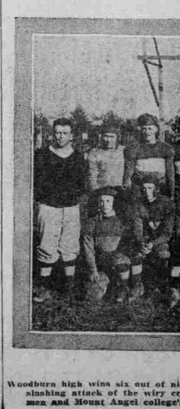
Woodstock high wins six out of nine games played during season. Among the teams that fell before the slashing attack of the wily crew were Stanford high, Greenham high, West Linn high, Willamette freshmen and Mount Angel college's second eleven.