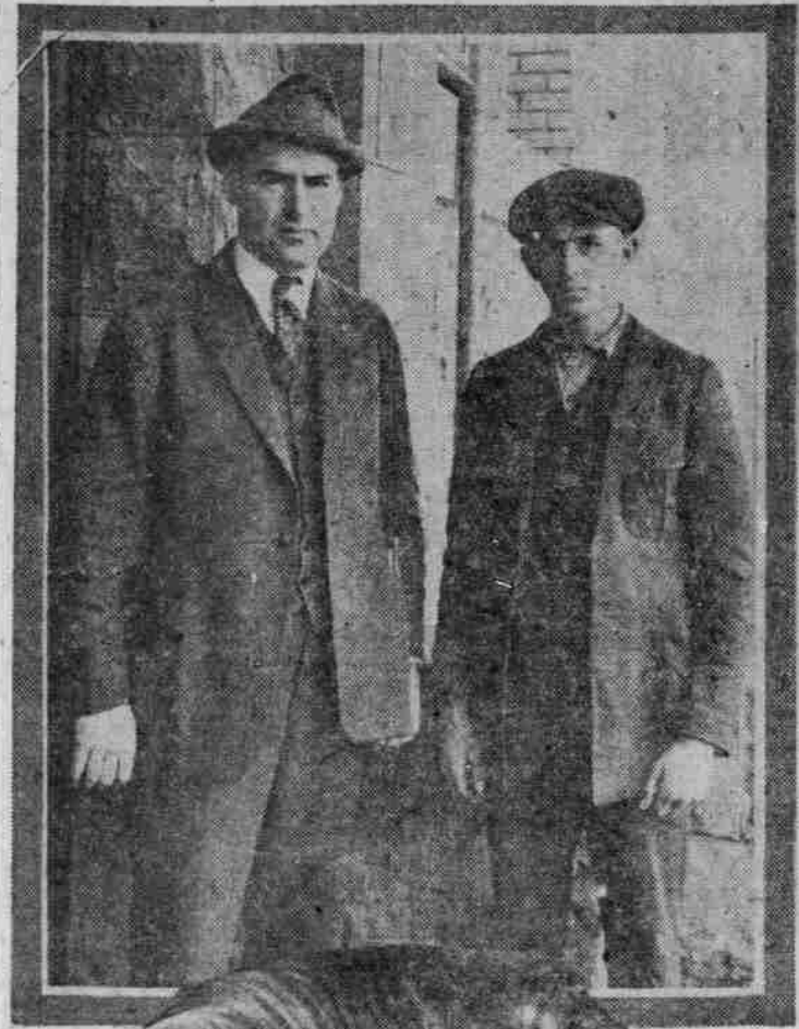
Youth Armed With Club.

In addition to two revolvers, the youth armed himself with a heavy club before approaching the cabin of the man he killed, despite the fact that he said he intended to ask for nothing but a meal and a little money to help him carry out his plan to run away from home.