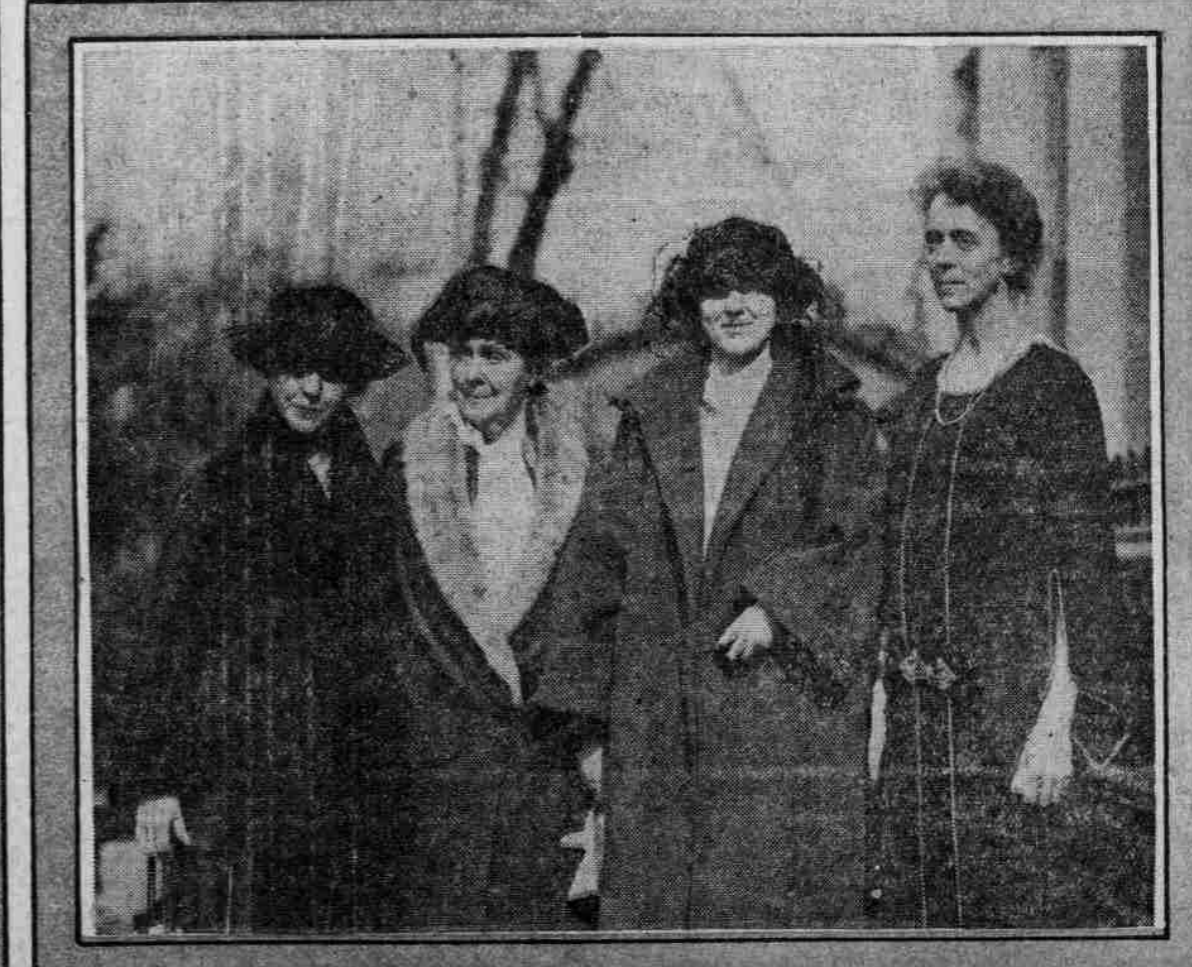
Western Delegates Of Woman's Party