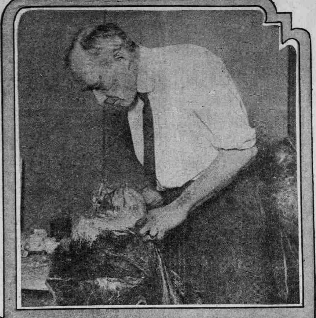
Models Gorilla's Face