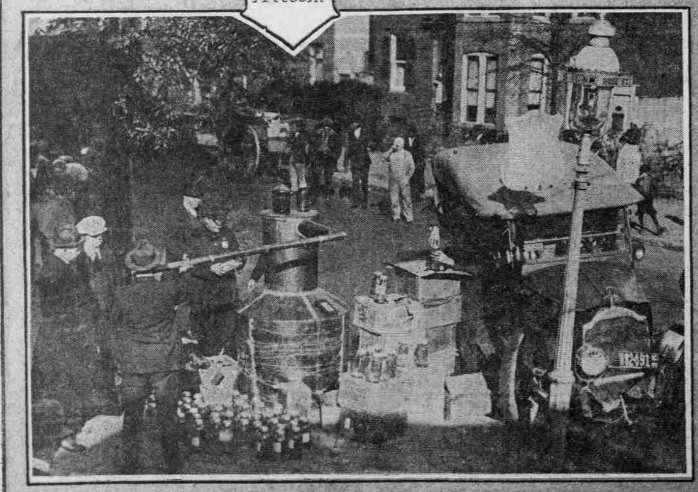
Biggest Still Captured In Capital