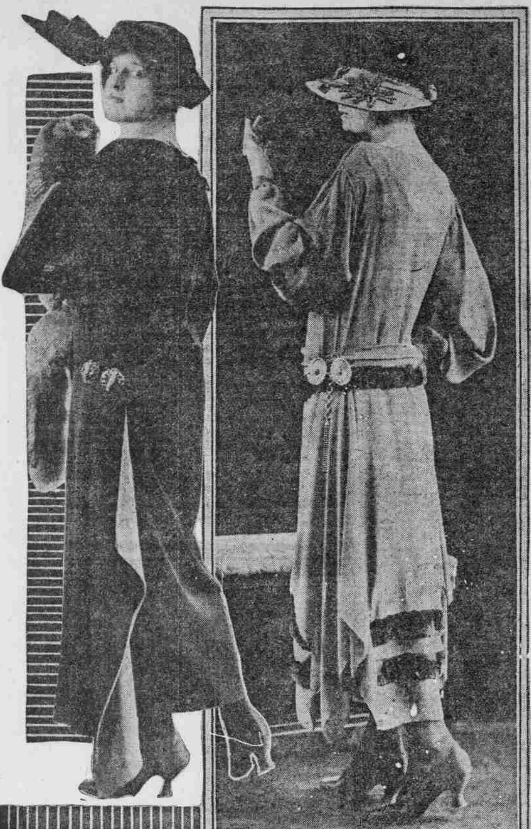
2657—Facing of colored silk Empire 2698—A popular and easy to make drapey

One of Most Beautiful Afternoon Wraps of Season Is of Old Blue Broadcloth With Enormous Sleeves of Black Broadcloth Overlaid With Pattern in Blue.