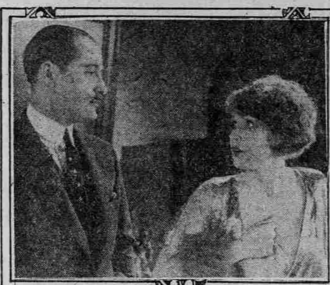
Montague Glass waxen effigy over "Hungry Hearts."

(Continued From First Page.) trains are herewith quoted, and are to be used as a guide as regards structure only. "A book of verses underneath the bough, A jug of wine, a loaf of bread—and thou shalt hear the whinging in the wilderness; Oh, wilderness were paradise now!"