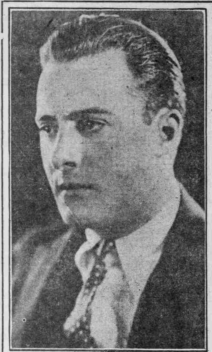
Gaston Glass, dashing romantic actor from France, who figures in many film love scenes, but seldom, if ever, wins the fair lady.

In Pictures But Two Years Yet Has Made Love to Ninety-nine Per Cent of Attractive Women Stars of the Screen.