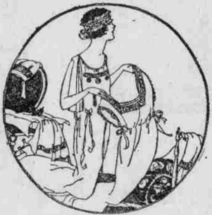
—Meier & Frank's: Third Floor. (Mail Orders Filled.)

The flesh crepe de chine of which these gowns and chemise are fashioned is unusually heavy and lustrous in appearance and never, we believe, have we seen lovelier designs. Many tailored and more elaborate styles are shown, among the latter gowns showing the new boat neckline. Trimmed with fine laces and satin ribbons.