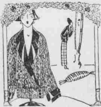
—Meier & Frank's: Fourth Floor. (Mail Orders Filled.)

Assortments particularly rich in gift suggestions range in price from $15 to $27.50.