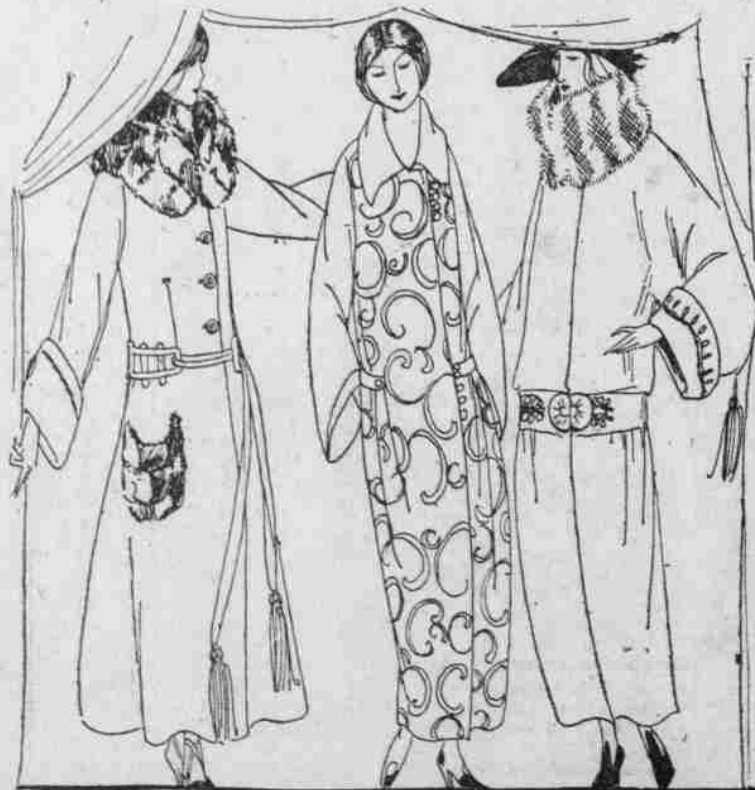
—Meier & Frank's: Fourth Floor. (Mail Orders Filled.)

—of bolivia and normandy—showing variations of the bloused, draped and straightline silhouettes. With self collars or trimmed with beaver, wolf, nutria, squirrel and mole. Brown, sorrento, navy and black. $47.50.