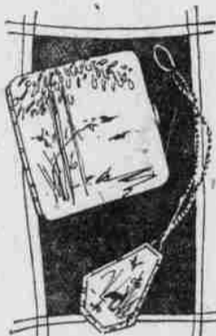
—Meier & Frank's: Main Floor.

Priced regularly $10.50 to $27.50—for Monday, one-fourth off.