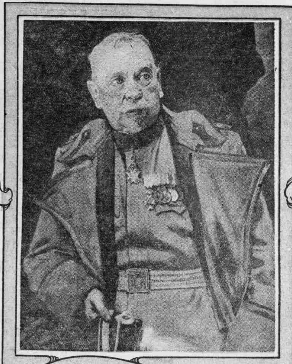
Portrait of Captain Gordon-Smith