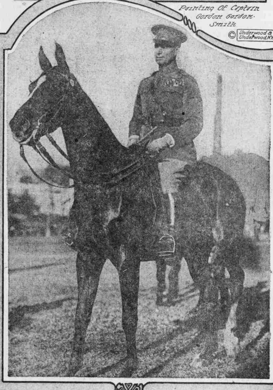
Air Chief Takes Part In Army Horse Show