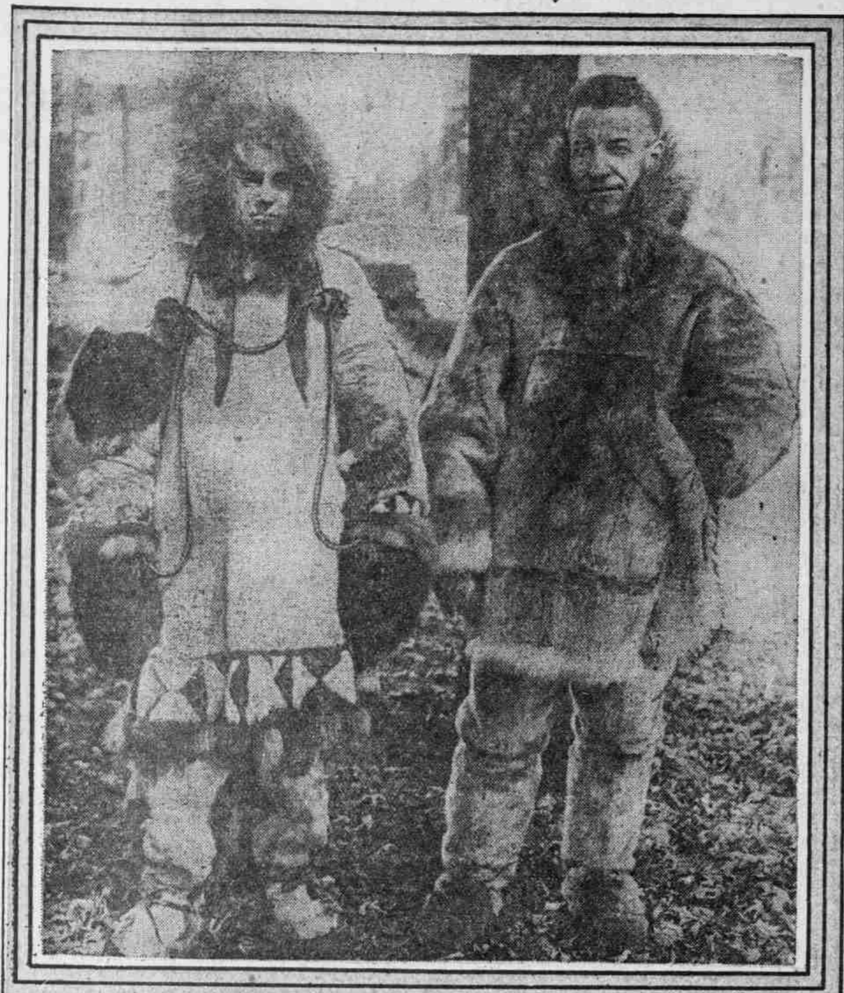
Teacher In Far North Returns From Amundsen's Camp