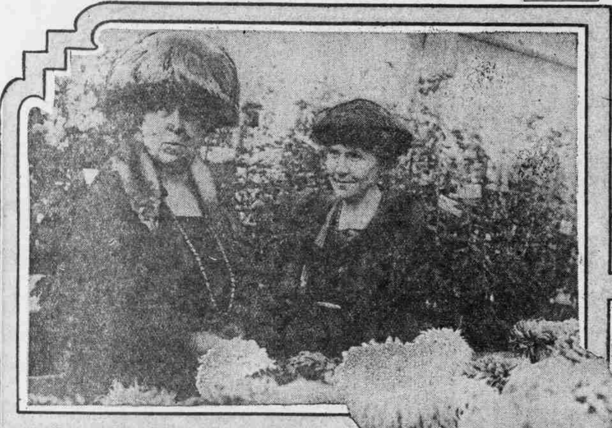
Wives of Cabinet Members Attend Flower Show