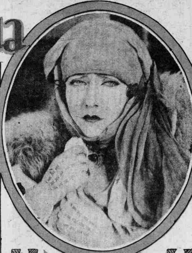
Gloria Swanson in "The Impossible Mrs. Bellow" at the Columbia.