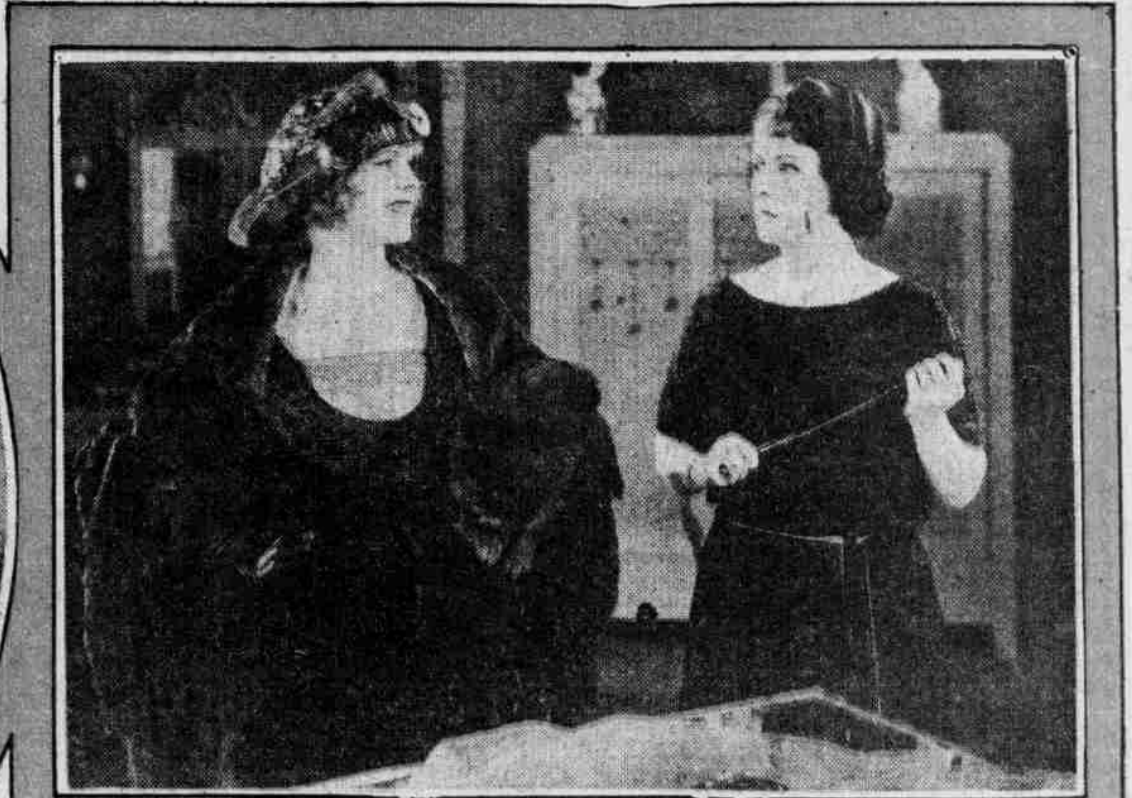
Scene from "Straight From Paris" at the Majestic.