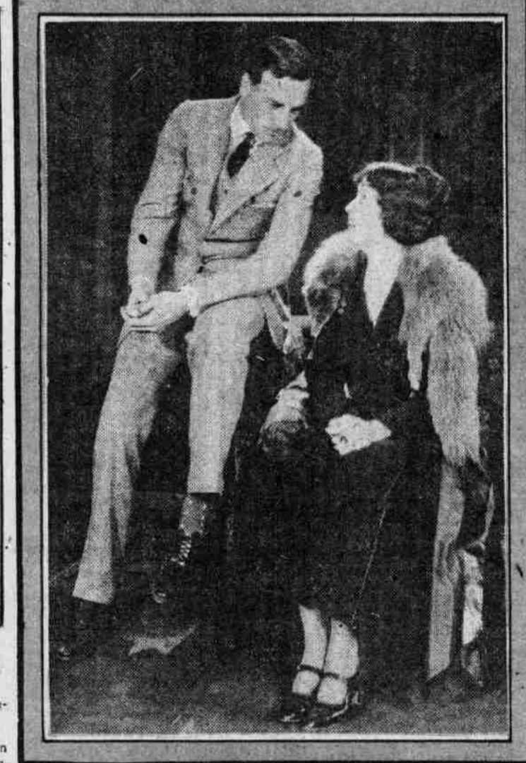
Milton Sills and Florence Vidor in "Skin Deep" at the Liberty.