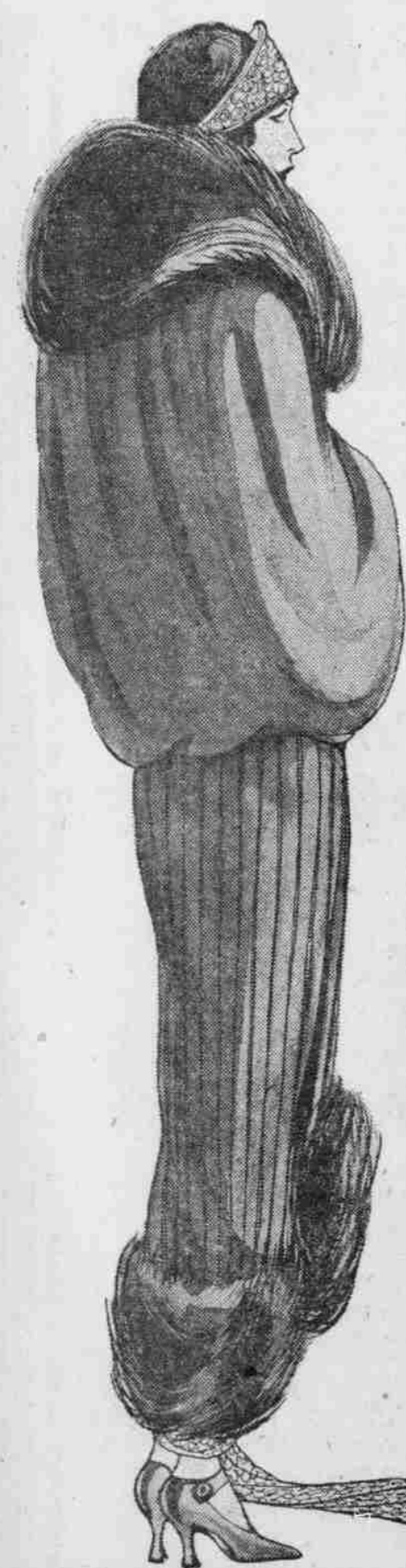
The lady at our left wears a cape of lustrous black heliosa, banded and collared with black wolf, made with fine tucks from waist to hem. It is lined with platinum crepe Renee, priced 250.00.

A garment of luxury—of clinging warmth—of furred depths—a marvel of beauty and comfort—such is the wrap of Winter. Fabrics of the deepest lustre and richest pile have a firm, new quality, as, for example, Heliosa. And linings—such as crepe Renee—are such as fashion some of the finest of our frocks!