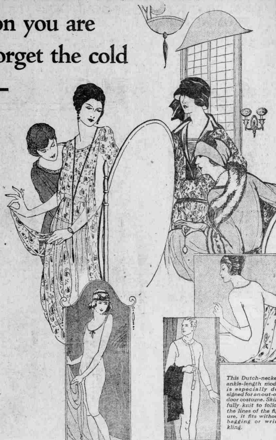
This Dutch-necked, ankle-length model is especially designed for an out-of-door costume. Skillfully knit to follow the lines of the figure, it fits without bagging or wrinkling.

you have. It is always a pleasure to see the interested readers of this department showing by their samples and enclosed styles of dress the proper relationship of fabric and line, season and color. Use the red for the buttons, collar and cuffs, also the strip girde. The joining seam will be neatest with a finished piped line on the skirt blouse whose edge continues for an inch below the stitching on the under side.