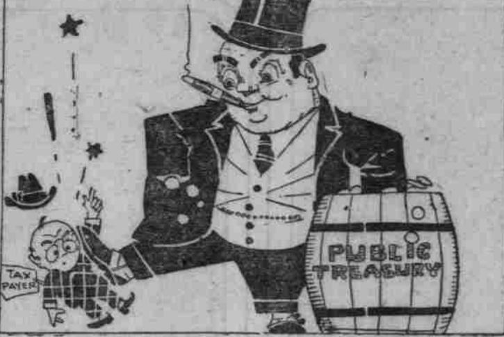
Aspirant for Congress Willing to Take All Possible Out of Office and D6 Little for It.

rowing money from me, which I will thus be able to get back again. I thank you for your kind attention, and I hope you'll all turn out and vote for me on election day.